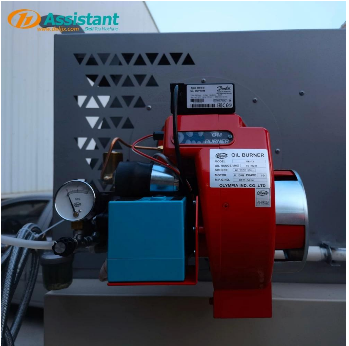
Japanese original Olympia burner.