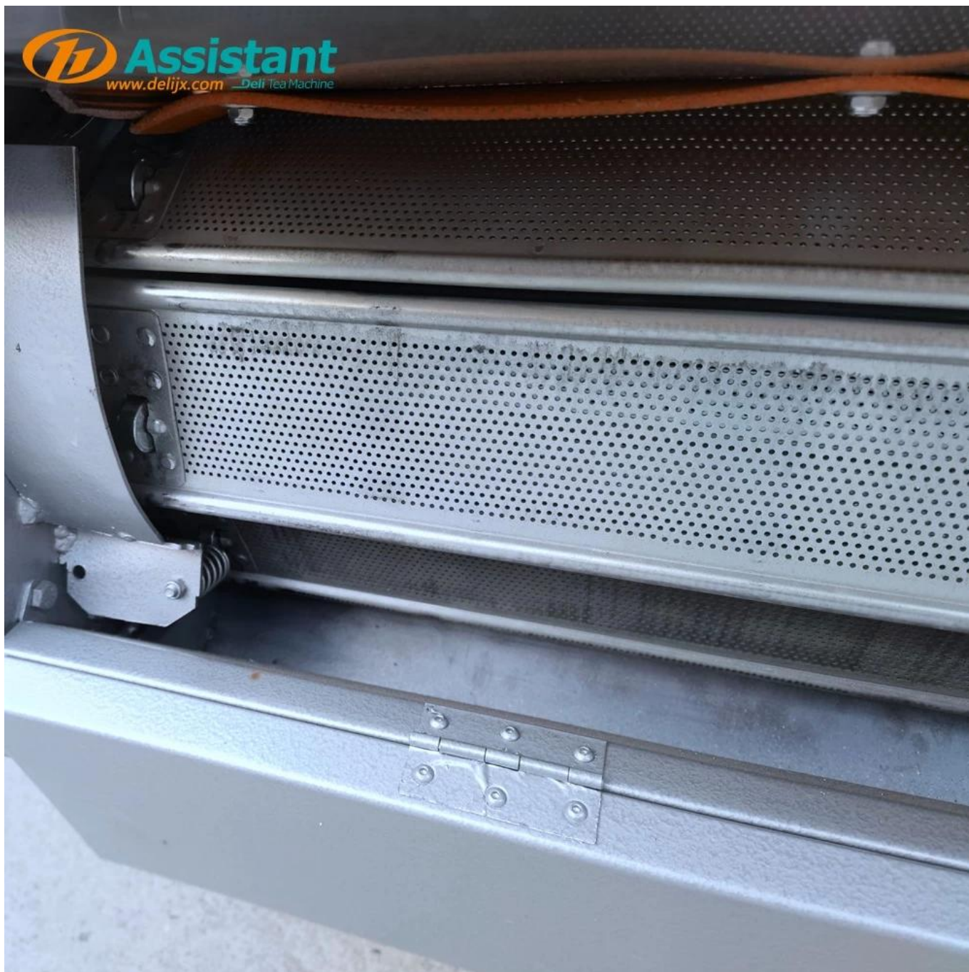
Stainless steel chain plate, food grade material.