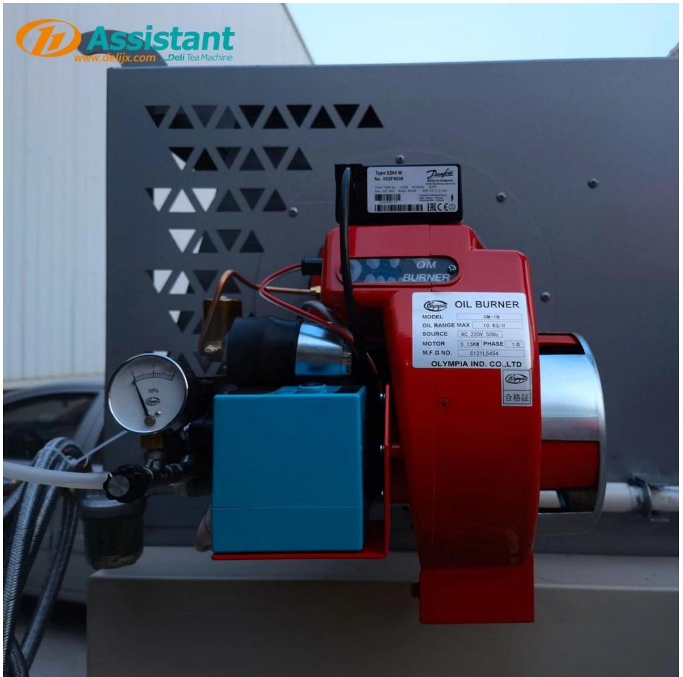
Japanese original Olympia burner.