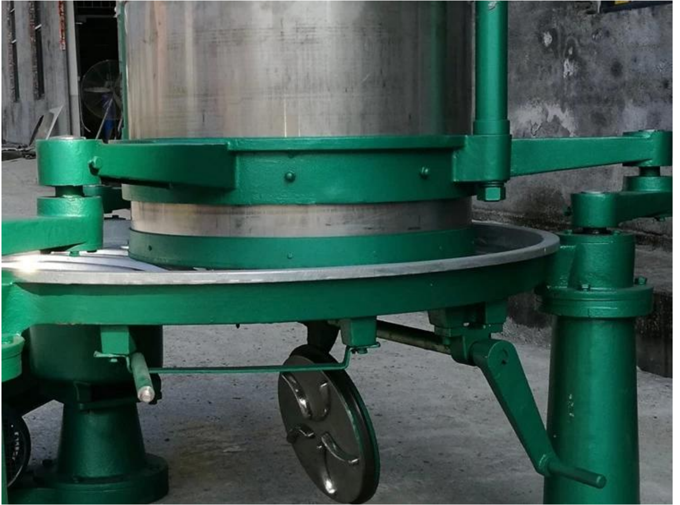
The supporting part of the machine is made of cast iron, which is strong and durable.