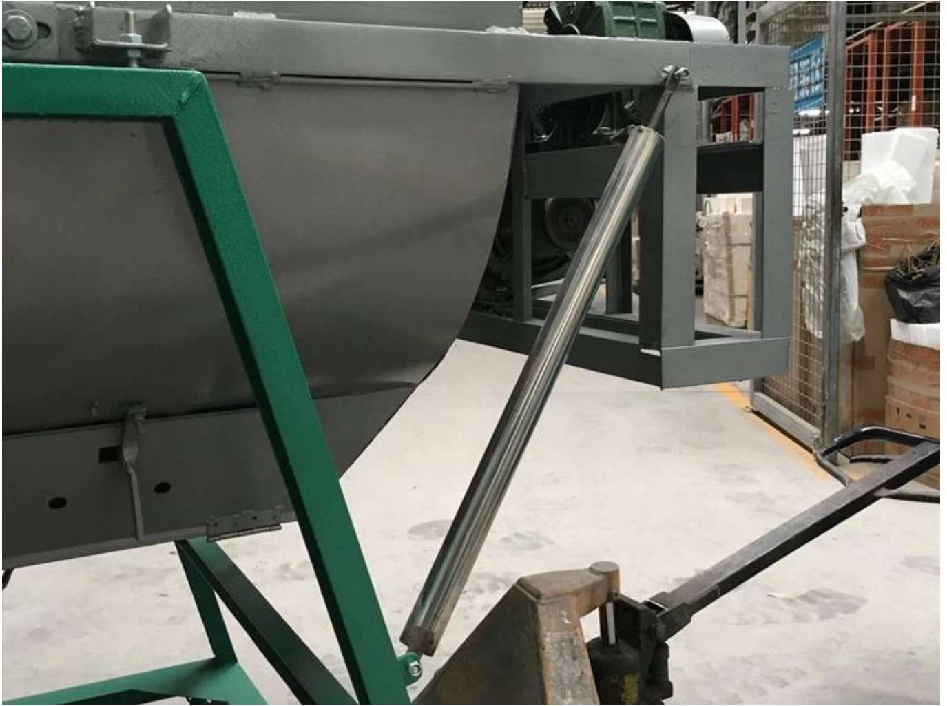
Pneumatic shock absorber design, the machine automatically falls back, and the falling speed is stable.