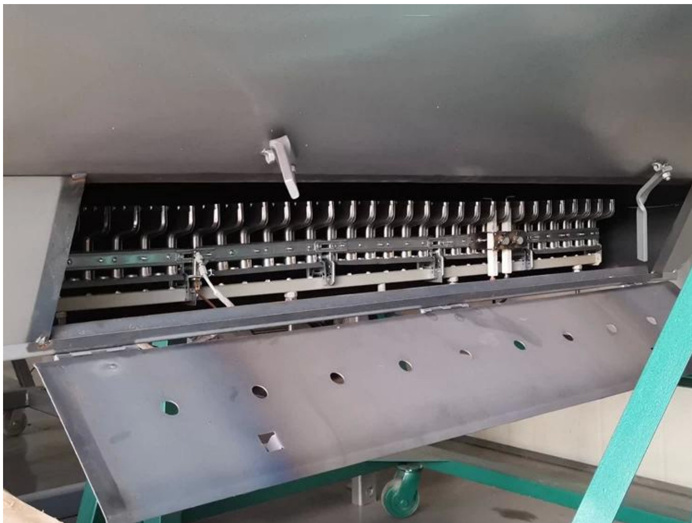
T-shaped combustion fire platoon covering the tea fixation barrel, burning area up to 100%.