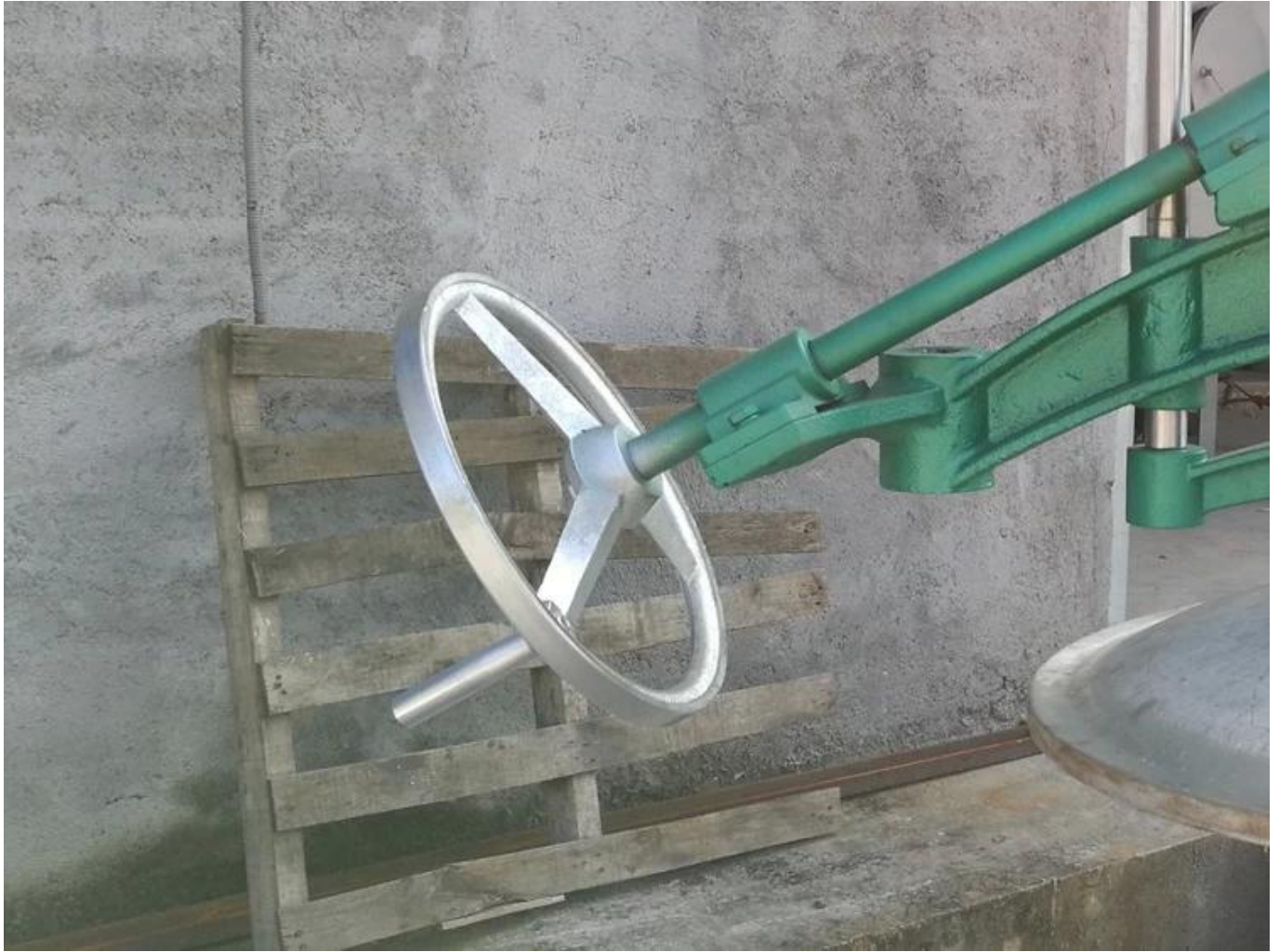
Enlarged handwheel design, faster lifting of the barrel cover.